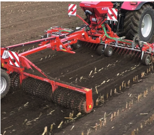
Control of the European corn borer with simultaneous sowing of a winter greening.