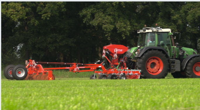
Harrowing, sowing and rolling in a single operation