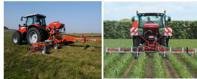
Pneumatic sowing unit It distributes the seed exactly and close to the ground.