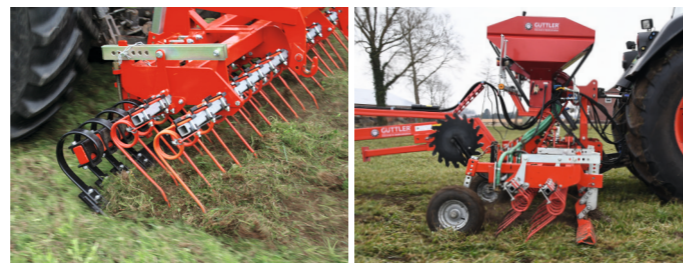
Options selectable between Ripperboard ...

1 The shortest 4-row harrow in the market (with Ripperboard)