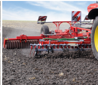
Cultivation of intercropping