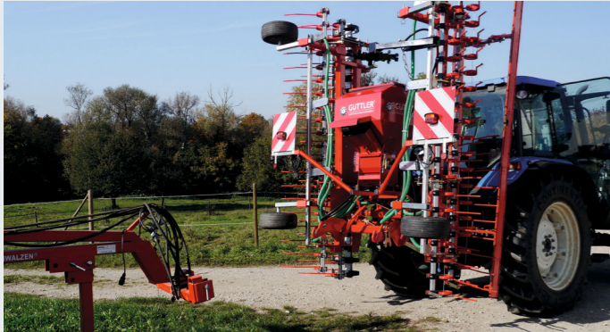
The roller is connected by quick couplers.