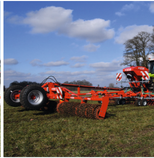
... or a GÜTTLER® Mayor