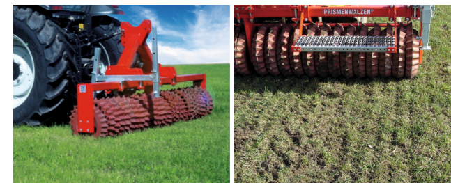
... ensures strong tillage, more sustainable turfs and higher yields!