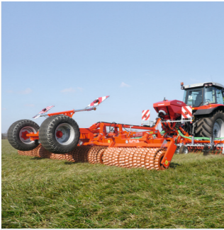
Optionally combinable with a GÜTTLER® Master ...

The GreenSeeder family can be combined with a GÜTTLER® trailed roller at any time.