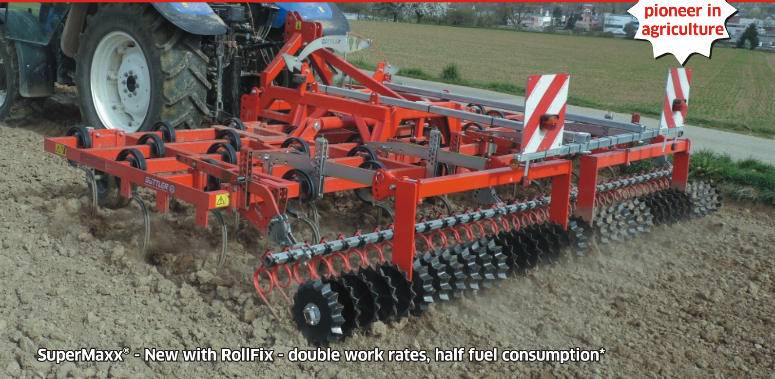
SuperMaxx® - New with RollFix - double work rates, half fuel consumption*