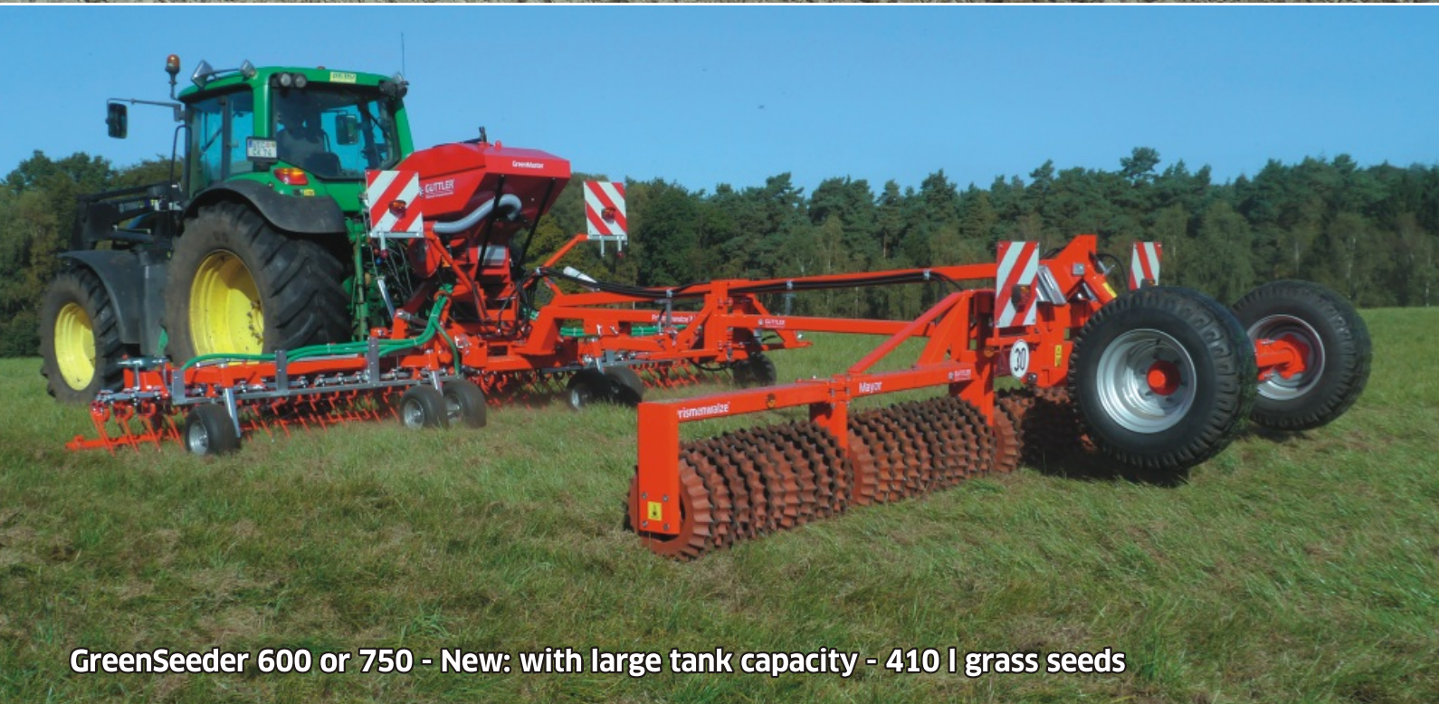
GreenSeeder 600 or 750 - New: with large tank capacity - 410 l grass seeds